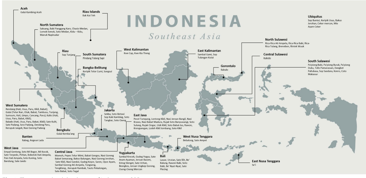
Fig. 2 The geographical distribution of Indonesian OBDs