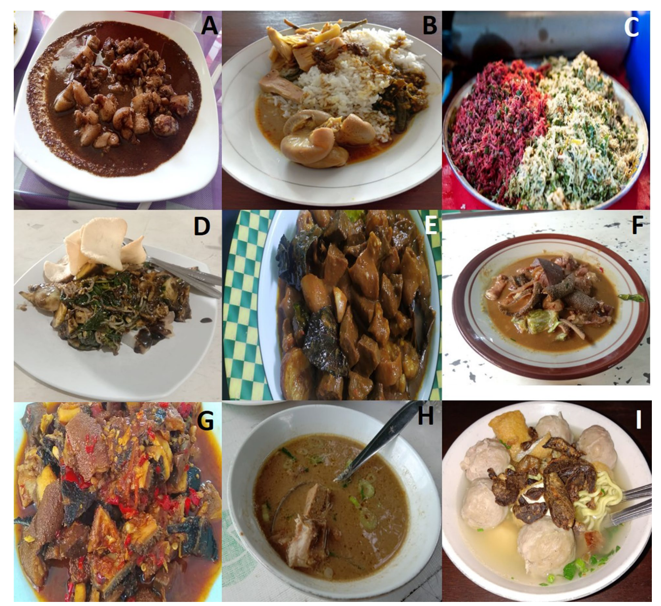
Fig. 1 Saksang (pork stewed in pig blood) from North Sumatra (A); gulai tambusu (intestine curry) from West Sumatra (B); lawar (Balinese mixed vegetable with grated coconut flesh) from Bali, added with pig blood (C); rujak cingur (lip salad) from East Java (D). momoh (braised offal) from Central Java (E); rabeg (Bantenese-styled mutton curry) from Banten (F); babat gongso (stir-fried cattle tripe) from Central Java (G); coto Makassar (Makassar-styled beef soup) from South Sulawesi, also utilizing offal (H); The ubiquitous bakso jeroan (meatballs with offal topping) (I)

western coasts of Sumatra), halal meats began to be utilized in dishes, including curry [20, 21]. Consequently, offal of halal animals also began to be widely consumed since it is considered halal and its usage could avoid a food disposal ( mubadzir ) [24, 25]. Offal can be discovered in number of recipes of gulai and kalio , such as gulai otak (brain curry), gulai tambusu (intestine curry) (Fig. 1B), kalio babat (tripe spicy curry), and kalio usus (intestine spicy curry) (Table 1). As there is a tradition among Minangkabau people to wander outside their