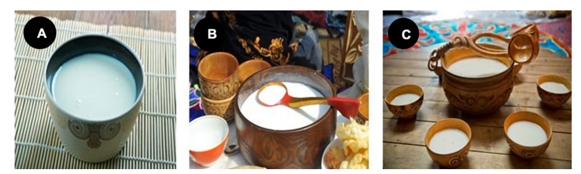
Fig. 4 Ethnic dairy products prepared from camel and horse milk A Chal; B Suusac; C Kumis