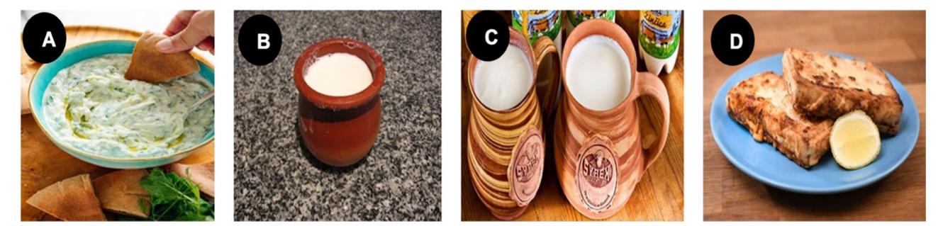
Fig. 3 Ethnic dairy products prepared from sheep milk; A Tzatziki; B Cuajada; C Zincica; D Saganaki