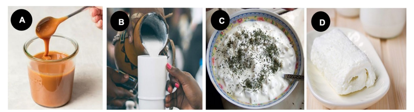
Fig. 2 Ethnic dairy products prepared from goat milk.: A Cajeta; B Mursik; C Matzoon; D Kaymak

Cajeta is available in various tastes, including vanilla, coffee, and chocolate. Producers sometimes add alcohol to it at a temperature of around 104 °C to give it a spirit flavour. Many producers also use baking soda to improve the texture of cajeta by altering the pH, which lowers protein aggregation. Its preparation can take up to 5–6 h because of high water content (Table 2), and the prolonged heat enhances the Maillard Browning Reaction, which results in caramel flavour. As it is a caramelized product, protein content of milk has most significant effect on its flavour and texture. High protein content causes aggregation and forms curd-like texture in caramel. Cajeta maker named it protein graining. Use of baking soda helps to resolve this problem [55]. Ultra-filtered (UF)-cajeta contains less lactose, potassium, and sodium and more protein, calcium, and phosphorus. Sensory qualities of the UF-cajeta after storage are superior as the UF process prevents the formation of bigger crystals and the development of sandiness in the product. A cajeta-flavoured whey beverage supplemented with inulin has a large consumer acceptance due to its beneficial functional characteristics and appealing sensory attributes [39]. Similarly, Ramirez and Vélez developed a novel cajeta milk beverage that provided consumers a potentially healthy product with reduced fat content and a fresh flavour [41].