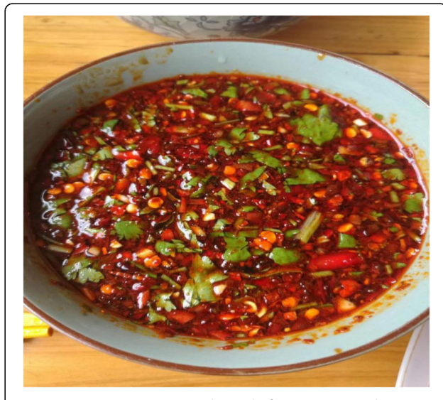
Fig. 5 Seasoning. Seasoning is the soul of Yunan cuisine. The ingredients in it are not fixed but can be added or removed according to one's taste. In general, seasoning includes pepper, star anise powder, chili powder, sesame powder, coriander, chives, and ginger

It is shocking to know that 75% of emerging infectious diseases originated from animals and no less than two-thirds of these originated in wildlife [42]. In modern