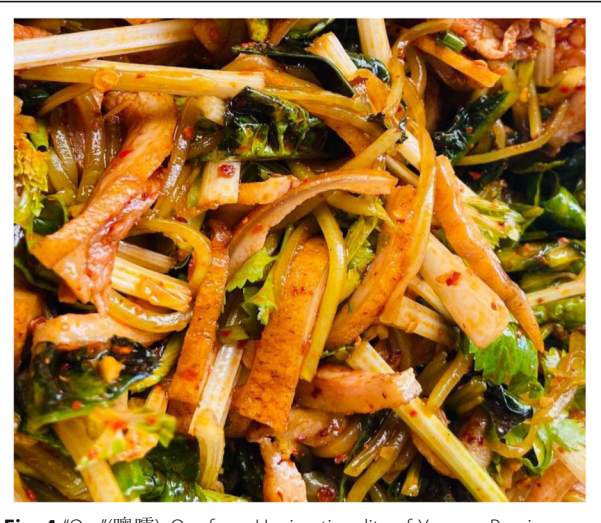
Fig. 4 "Oru"(噢嚅). Oru from Hani nationality of Yunnan Province, China. It is cold vegetables with raw pork

canh" [40]. A case-control study conducted between May 2006 and June 2009 showed that risk factors identified for Streptococcus suis infection included eating "high risk" dishes such as undercooked pig blood (OR 2.22; 95% CI 1.15, 4.28) and pig intestine (OR 4.44; 95% CI 2.15, 9.15) [41]. In 2015, five swine streptococcus infections cases were reported, three of which were caused by eating raw blood pudding.