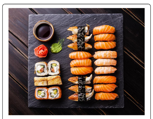
Fig. 1 "Sushi". Sushi is a traditional Japanese dish, usually made by cutting fresh sea urchin yellow, abalone, peony shrimp, scallops, salmon roe, cod roe, tuna, salmon, and other seafood into slices and placing them on the rice ball