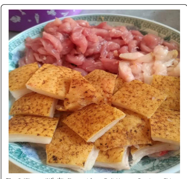
Fig. 3 "Shengpi"(生皮). Shengpi from Dali, Yunnan Province, China. Shengpi is a traditional dish of Bai nationality. The Bai people always take it as their signature dish and specialty dish during the festival or the daily gathering. There are two ways to eat Shengpi, one is that meat and seasoning are not put together, and the other one is to mix seasoning and meat directly

Streptococcus suis is a gram-positive strain of pathogenic bacteria and a pathogenic zoonotic factor [38]. In Vietnam, Streptococcus suis infection was one of the most common cause of acute bacterial meningitis in adults [39]. There was a dish called "tiet canh" (raw blood pudding) which was acclaimed wildly in Vietnam [3]. The major ingredients of "tiet canh" were raw pig blood and other animals' blood mixed with minced pork tissues. Streptococcus suis was a common bacteria in "tiet